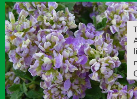
The Judges' Choice 2024: Aubrieta ' Shangarry '. First listed in 1935 and probably named after Shanagarry in County Cork, Ireland.