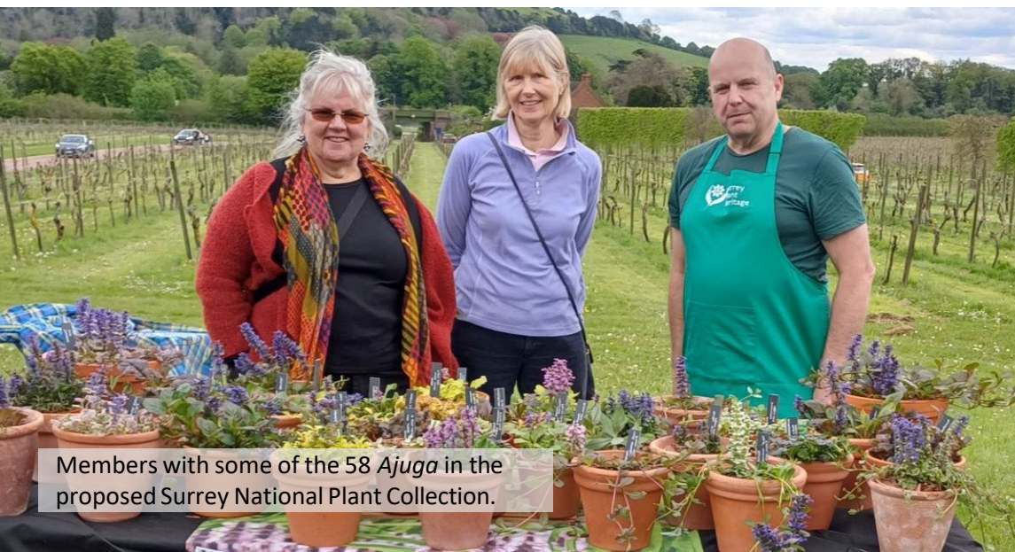
Members with some of the 58 Ajuga in the proposed Surrey National Plant Collection.

Our 50 th anniversary in 2028 will be a big moment for the charity. One of our ambitions is to create an interactive, online version of the National Plant Collections. We also want to expand and diversify our membership and our partners, so more people get involved in our work and can benefit from the plants, knowledge and networks we offer.