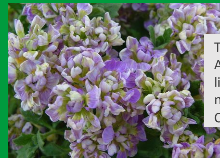
The Judges' Choice 2024: Aubrieta ' Shangarry '. First listed in 1935 and probably named after Shanagarry in County Cork, Ireland.