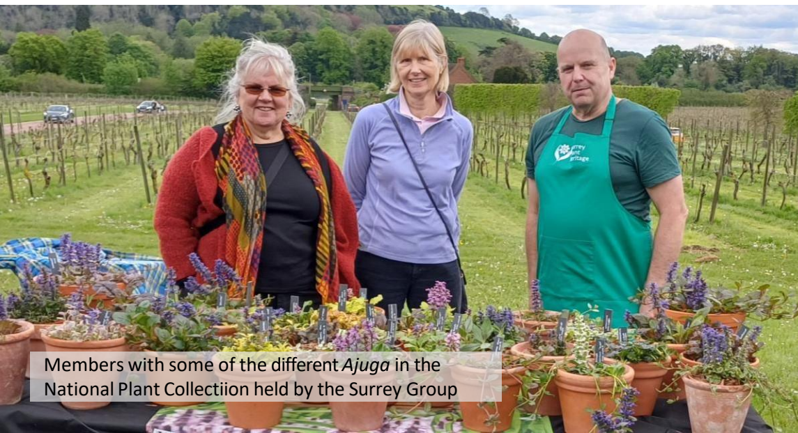
Members with some of the different Ajuga in the National Plant Collection held by the Surrey Group

In the lead up to our 50 th anniversary in 2028, we are working to raise our profile and to create an interactive, online version of the National Plant Collections. We also want to expand and diversify our membership and our partners, so more people get involved in our work and can benefit from the plants, knowledge and networks we offer.