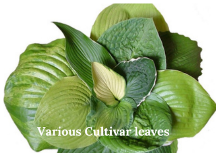
Various Cultivar leaves

Rupert Eley East Bergholt Place, East Bergholt, CO7 6UP 01206 299 224