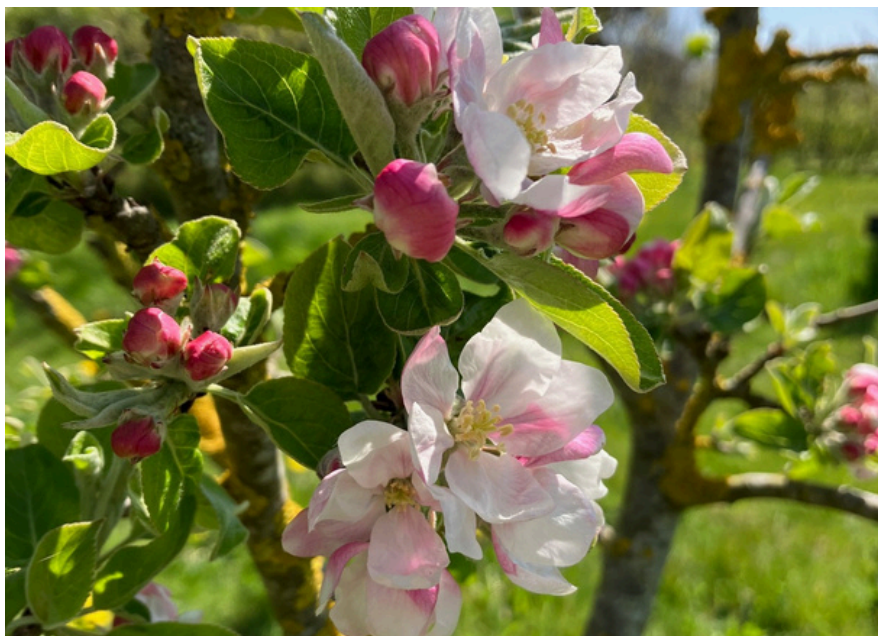
Malus 'Aldeburgh Beach', in the Suffolk Garden Plants collection

There are even more plant groups to protect, so whether you're curious about plants, big or small, we are confident that there will be a plant group to suit your passion.