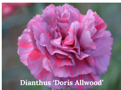
Dianthus 'Doris Allwood'

Debbie Amor 10 Morton Road, Lowestoft NR33 0JQ 07565 966 682