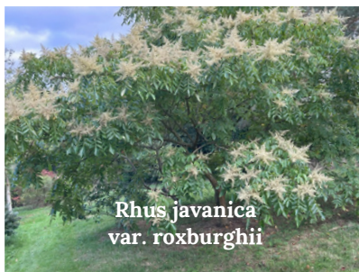
Rhus javanica var. roxburghii