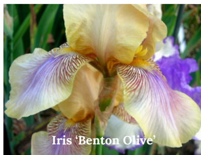
Iris 'Benton Olive'