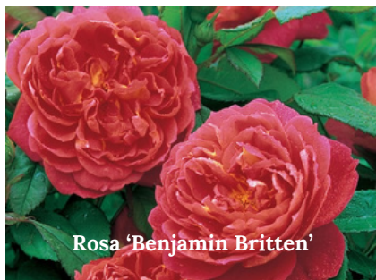
Rosa 'Benjamin Britten'