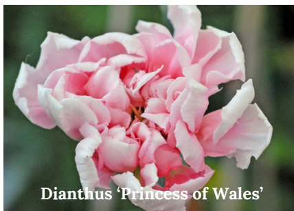
Dianthus 'Princess of Wales'