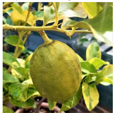
Above: A Lemon of royal provenance at Hampton Court Palace