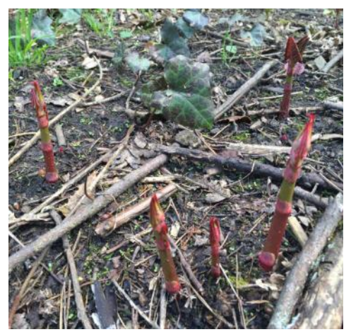
The young shoots as they emerge

Personally, I will stick to the wine, but maybe not a whole bottle.