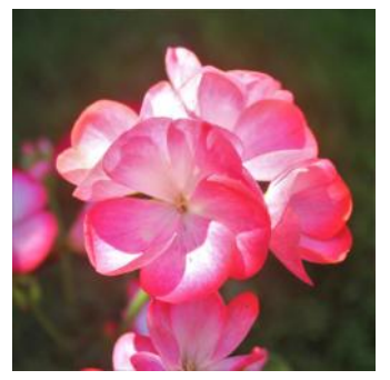
Above: Pelargonium 'Hollywood Star' (Plant Guardian worthy)