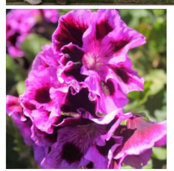
Above: Pelargonium 'Royal Surprise' (Plant Guardian worthy)