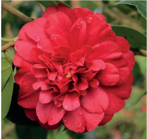
CAMELLIA 'AGNES OF THE OAKS'

In October 1978, the RHS convened a conference bringing together over 100 representatives from botanic gardens, horticultural colleges, nurseries and private gardens and estates. They decided to create a national body, which eventually was named the National Council for the Conservation of Plants and Gardens (NCCPG). In 1980, the first National Plant Collections were created as part of a pilot project. By 1990 the number of National Collections had risen to 500, encompassing National Trust properties, council parks, nurseries and private gardens.