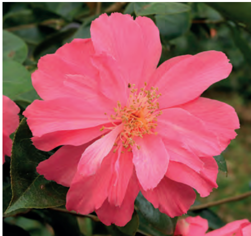
CAMELLIA 'OLGA CARLYON'