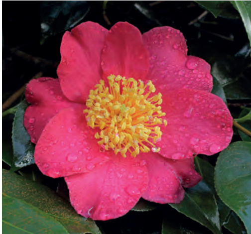
CAMELLIA 'MATTIE COLE'

Now that electronic recording is standard we recommend the use of a horticultural database. Plant records can be stored and linked to images, cultural information, research relating to that plant, map locations and much more