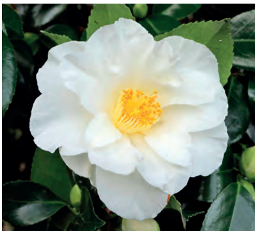
CAMELLIA 'LAURA SCHAFER'

This leaves 11% (187) cultivars that we know to have existed in the UK that can't be found (full list available on request) – cultivars such as 'Cornish Pink', on sale till the mid-1990s, 'Harlequin', once grown in, but now lost from a National Collection and 'Golden Wedding', available commercially up until 2015. It may well be that readers of this article will know of some of these missing cultivars – if so we would love to hear from you. If you have one of these growing