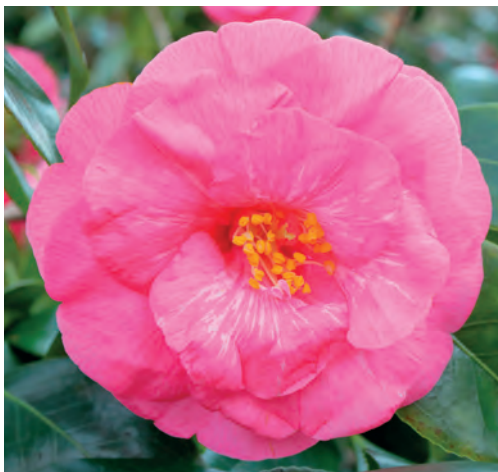
CAMELLIA 'THOMAS CORNELIUS COLE' JIM STEPHENS

Across the seven NPCs, 280 cultivars are unique to these collections and are not known to be found anywhere else. 154 threatened cultivars are duplicated across more than one collection, though only six are replicated in three collections.