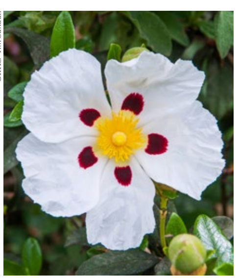
Cistus × dansereaui 'Jenkyn Place'

Many more could be recommended. Nurseries must always be contacted in advance about availability.