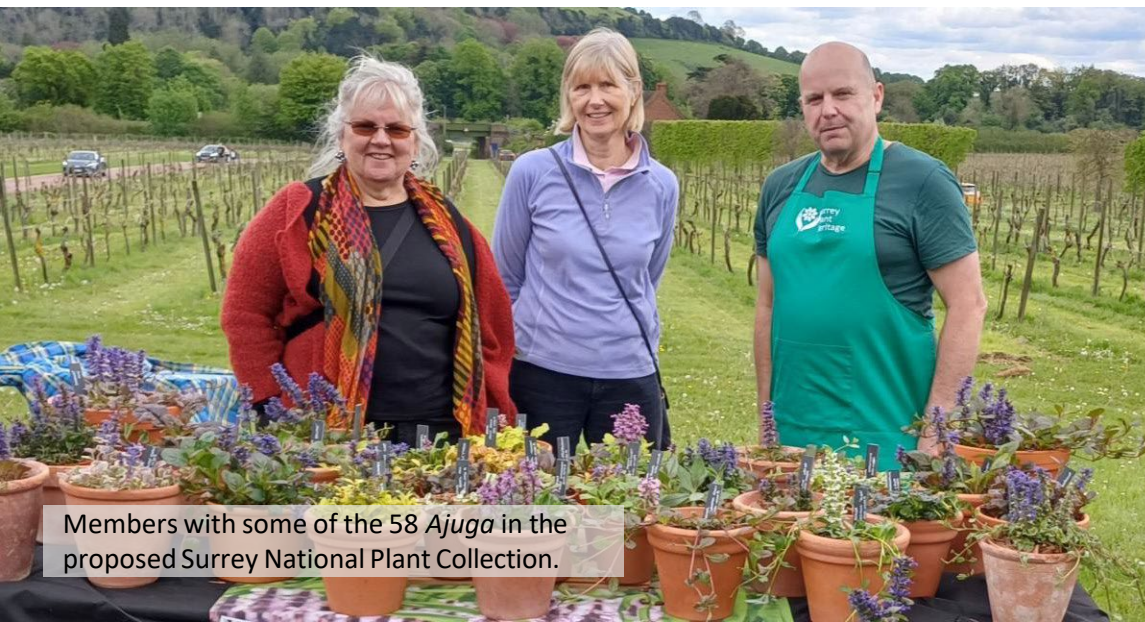
Members with some of the 58 Ajuga in the proposed Surrey National Plant Collection.

Our 50 th anniversary in 2028 will be a big moment for the charity. One of our ambitions is to create an interactive, online version of the National Plant Collections. We also want to expand and diversify our membership and our partners, so more people get involved in our work and can benefit from the plants, knowledge and networks we offer.