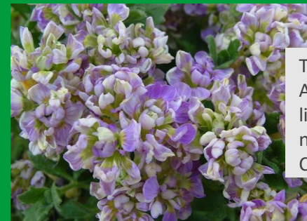
The Judges' Choice 2024: Aubrieta 'Shangarry' . First listed in 1935 and probably named after Shanagarry in County Cork, Ireland.