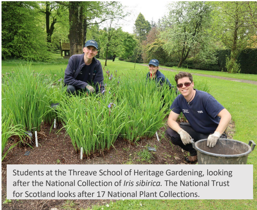
Students at the Threave School of Heritage Gardening, looking after the National Collection of Iris sibirica . The National Trust for Scotland looks after 17 National Plant Collections.

We organise talks, workshops, garden visits and take part in public events like flower shows to build understanding of the importance of plant conservation, and to share skills like seed collecting and plant recording.