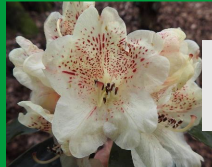
The People's Choice 2024: Rhododendron 'Leonardslee Primrose' . Now rarely if ever found outside Leonardslee Gardens, Sussex.

We run a public competition asking people to nominate a rare plant, as a fun way to draw attention to a serious issue.